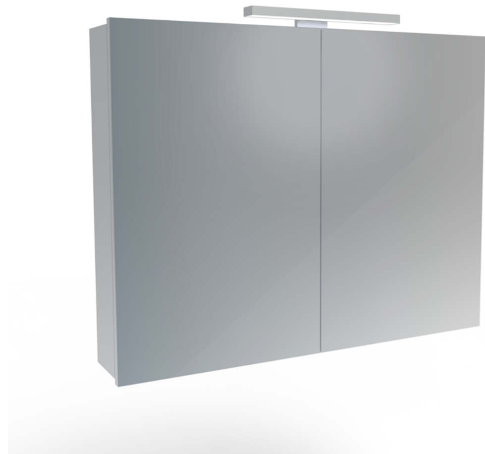
Product Code: OLY090EC