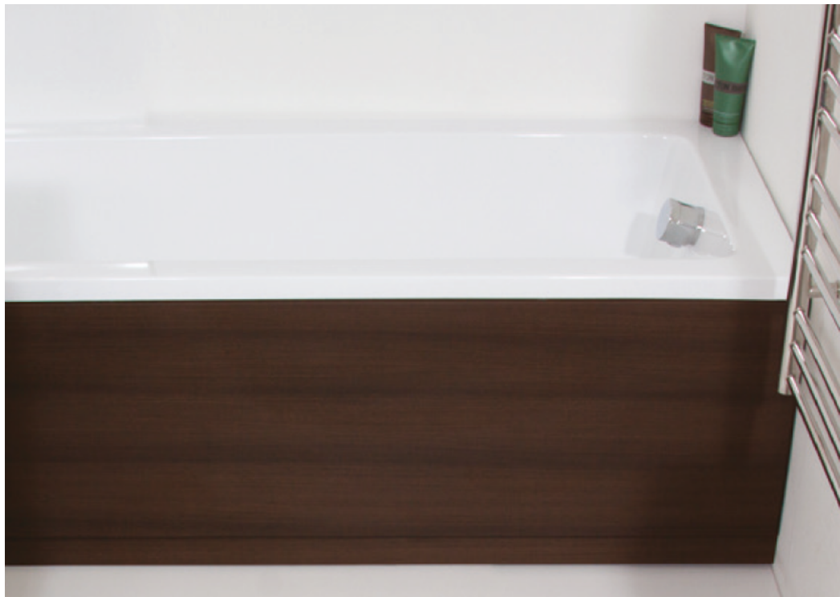
Product Code: BG7003