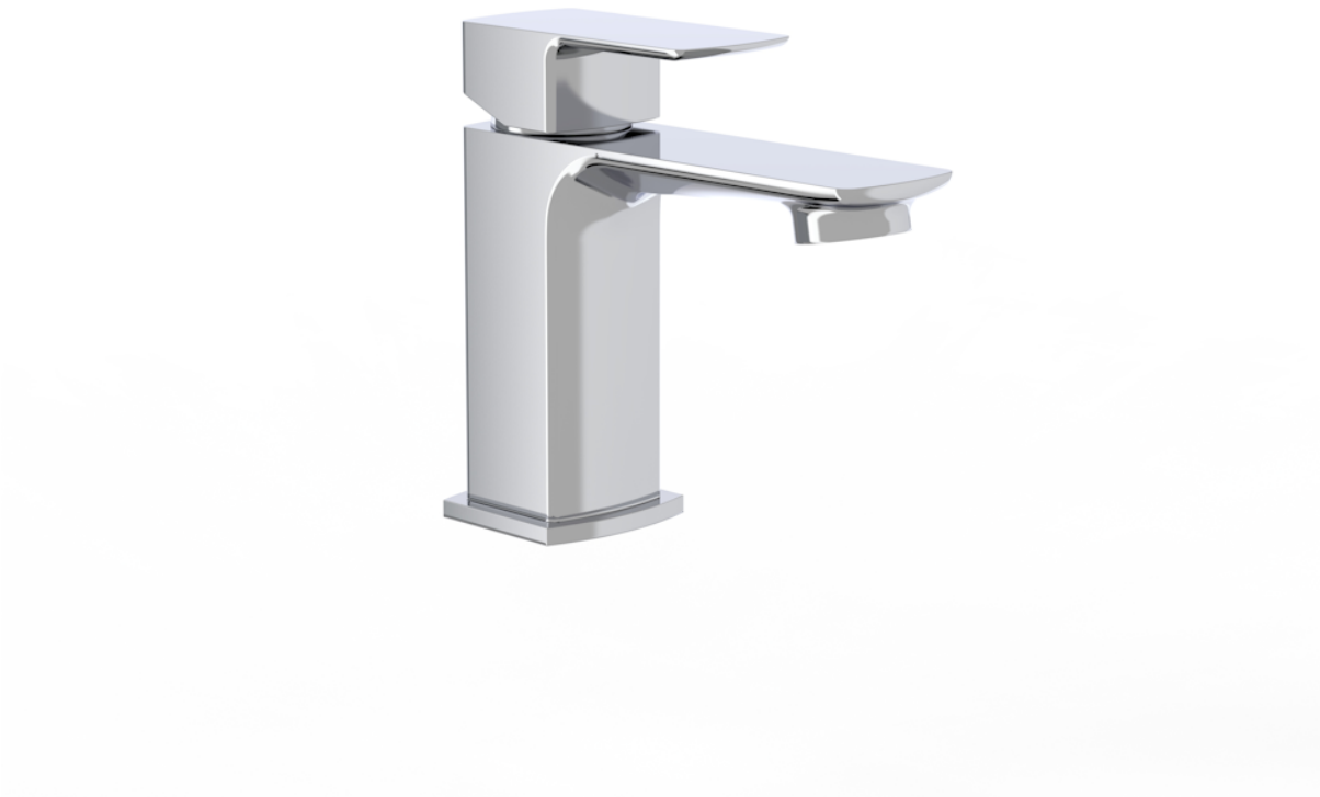
Product Code: NTBM01