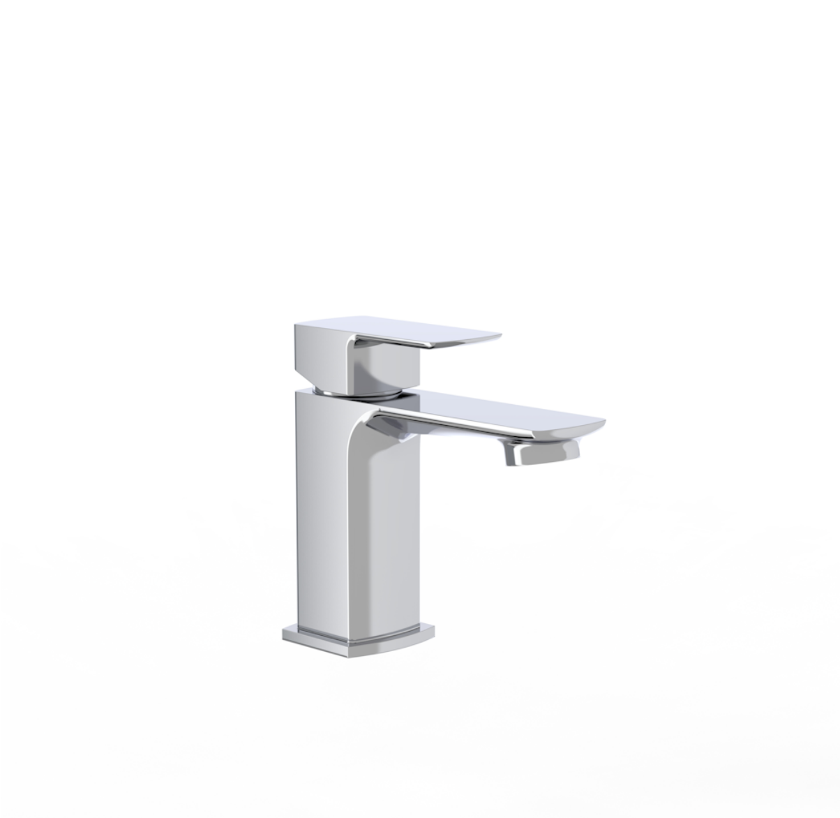
Product Code: NTBM01