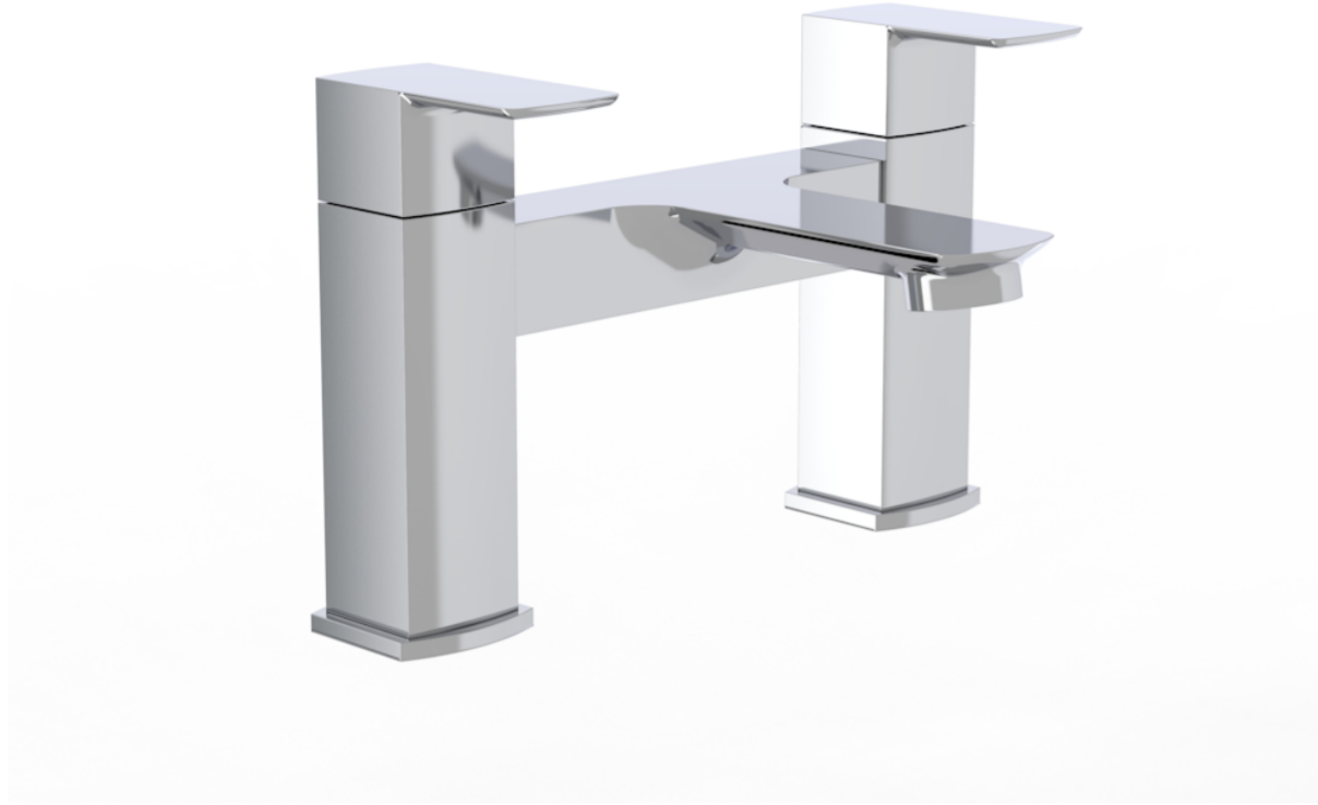
Product Code: NTBF01