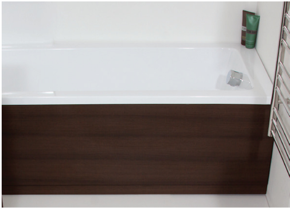
Product Code: BP7003